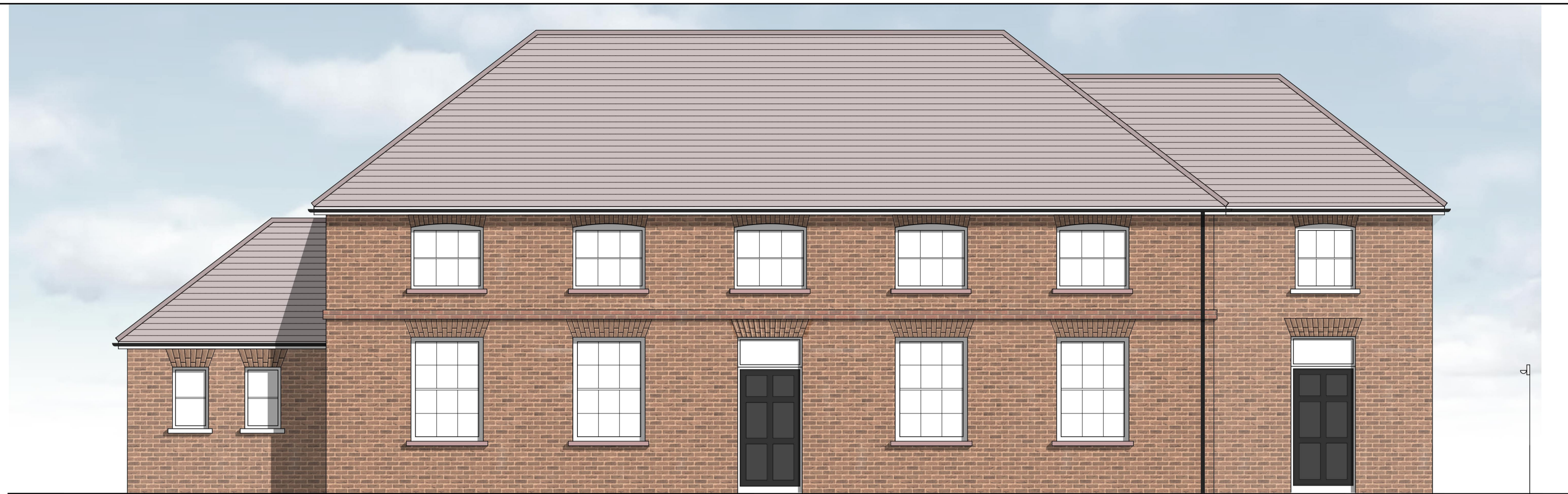
ELEVATION TO HADLEY COMMON AND GARDEN