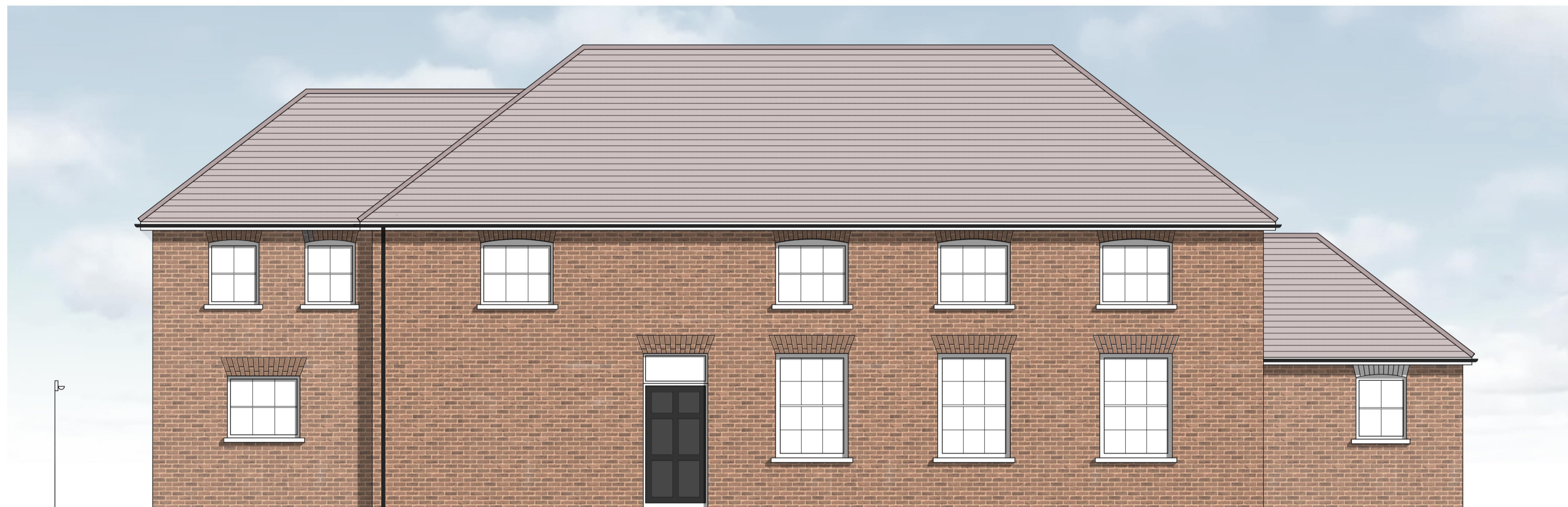
ELEVATION TO CHURCH AND GRAVEYARD