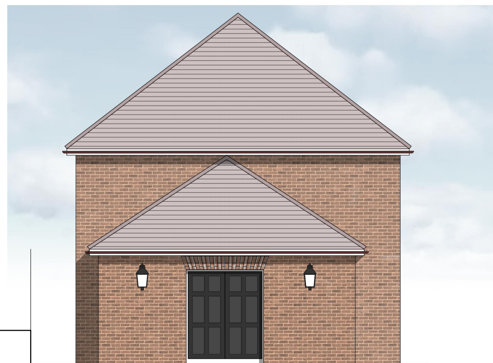
FRONT ELEVATION TO CAMLET WAY